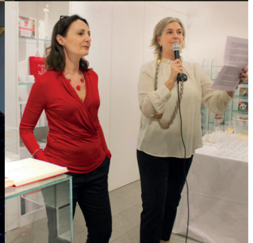
1. Punto sull'Arte, American Illusions, 2021