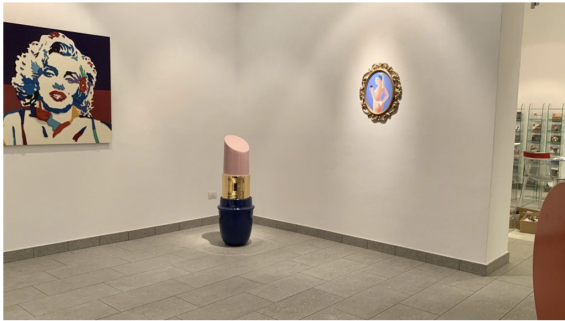
Lollipop. Courtesy of Punto sull'arte

Colourful, joyful, effervescent, Neopop is the theme of the exhibition with which the PUNTO SULL'ARTE gallery is presented to the public renovated and doubled in size, with the large new rooms on the upper floor ready to welcome projects and new artists. OPENING RECEPTION SATURDAY 30 MARCH from 6pm to 9pm.